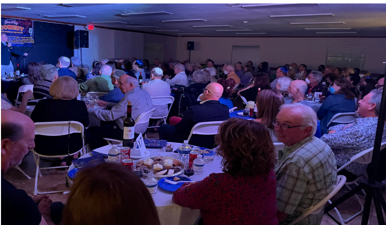
Comedy Night @ Chabad