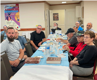
Club 770 Sunday presentation