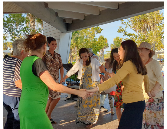
Lag B'omer at Siesta Key Beach